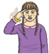
My name is...